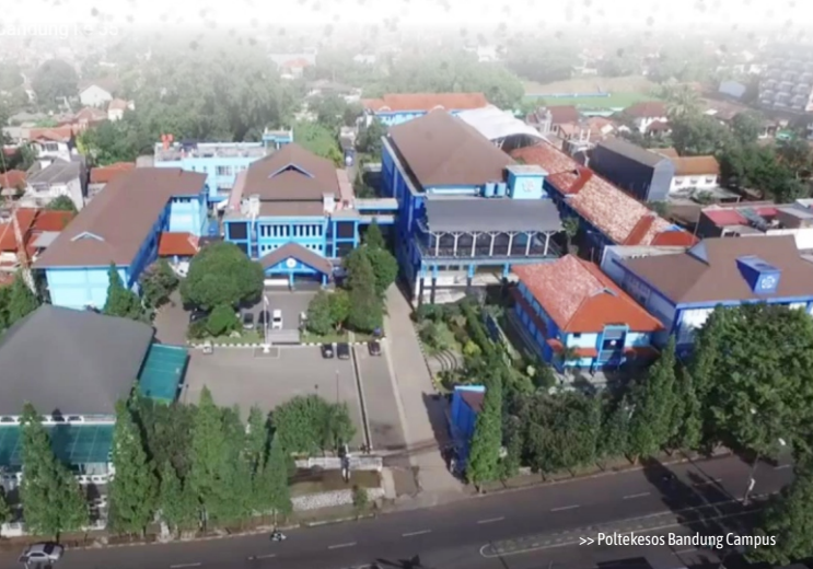
>> Poltekesos Bandung Campus